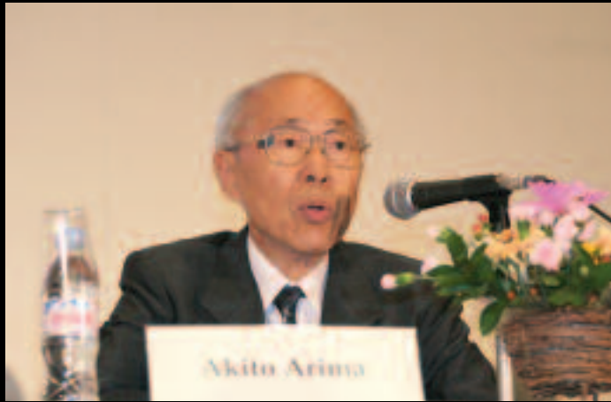
AKITO ARIMA, Former Minister of Education, Japan

Respect for nature is at the heart of traditional Asian cultures.