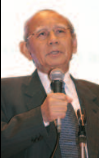
EMIL SALIM, Professor, University of Indonesia Member, Asia-Pacific Forum on Environment and Development

Sustainable development requires a system of life-long learning and education that transforms values.