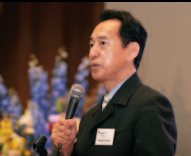
MAMORU MOHRI, Astronaut and Executive Director/CEO, National Museum of Emerging Science and Innovation, Japan

Sustaining does not mean simply maintaining the status quo.