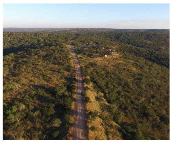
Sustainable Tourism creates new economic opportunities and income sources for local communities. This photograph shows a lodge in Mlawula Nature Reserve/Eswatini, part of the 2019 designated Lubombo Biosphere Reserve.

Jozani-Chwaka Bay Biosphere Reserve on the island of Zanzibar in Tanzania serves as an interesting example of inclusive decision-making and revenue sharing in a Biosphere Reserve: a large share of the tourism income generated by the management unit is transferred to local communities. These communities have developed a collective process in which they decide about concrete projects that are funded from this income.