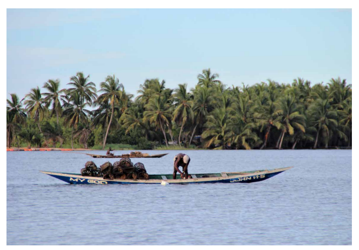
Biosphere Reserves aim at balancing nature conservation and socio-economic development. The photograph shows fishermen in Songor Biosphere Reserve/Ghana.