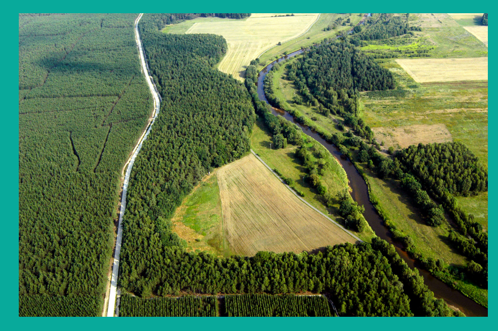
Federal States: Brandenburg and Saxony and the Lubusz Voivodeship in Poland Area: approx. 580 km<sup>2</sup>