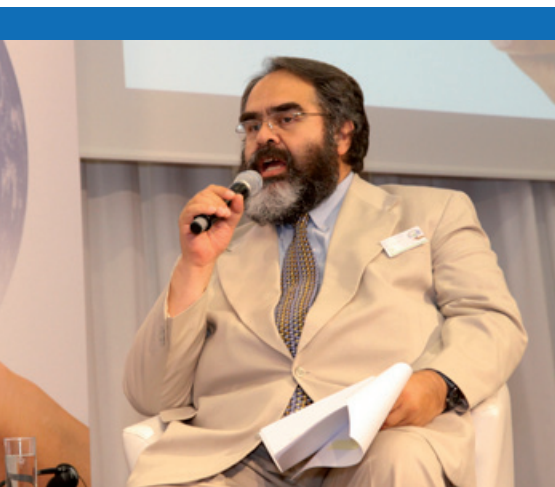
Ambassador Jorge Jurado

At the Rio+20 conference in June 2012 in Brazil, the major themes will be Green Economy and effective institutions for sustainable development. “In these two areas biosphere reserves have been working for a long time; these are new words for old stories. Rio+20 really can be an opportunity for biosphere reserves to strongly assert: ‘We are doing these things.’ Not every biosphere reserve is doing things perfectly, but there are lots of good examples.”