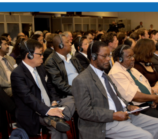
The audience listening to the wrap-up session

for conservation and research with only some minor efforts at community involvement. Over the years and culminating in 1995 in the adoption of the Seville Strategy at the 2 nd World Congress of biosphere reserves, they have reinvented themselves as landscapes dedicated to sustainable development; this new approach was subsequently implemented at national level. In 2008, at the 3rd World Congress, the Madrid Action Plan was adopted and new objectives such as addressing climate change and urbanization have been accepted as being objectives of biosphere reserves.