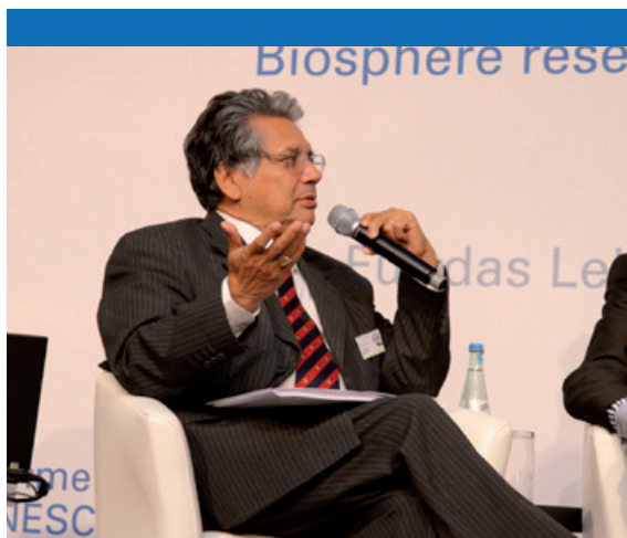
Prof Dr Luis Aragón

The moderator finished this first panel discussing how biosphere reserves can become laboratories of best practice on adapting to changing vegetation patterns. Martin Price underlined that from a practical point of view, climate change is always mixed up with many other changes taking place such as demographic change; at the same time every landscape is different. It is especially with regard to societal mechanisms that biosphere reserves can make a difference: “Getting people to actually work with each other, to understand the need to cope with a changing situation. There is a real opportunity for biosphere reserves, because from an institutional point of view the fundamental basis of a biosphere reserve is cooperation between different stakeholder groups. They provide an ideally suited space to define: ‘Who can work together with whom to make better things happen?’ In each place it will be a different set of circumstances, a different set of stakeholders. But if the institutions are good and flexible, it will work.” He commended the research work of Professor Susanne Stoll-Kleemann from Germany as being outstanding in supporting better institutions. “Biosphere