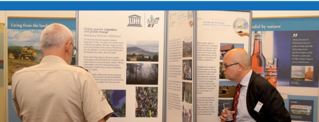
An exhibition highlighted 28 climate change-related good practice case studies from the World Network of Biosphere Reserves

Biosphärenreservate sind ein wirksames Instrument zum Klimaschutz sowie zur modellhaften Anpassung an seine Folgen. Dies gilt vor allem in den Bereichen nachhaltige Landnutzung, umweltverträgliches und Ressourcen schonendes Wirtschaften, Sicherung von Ökosystemdienstleistungen, Energieeffizienz und Einsatz erneuerbarer Energien. Biosphärenreservate sind Bildungsorte für nachhaltige Entwicklung.