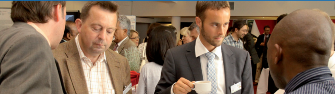
Conference participants in the exhibition hall

estilo de vida sostenible. Con tal propósito, las reservas de biosfera representan un elemento importante como garantía de una Tierra habitable para el futuro de las generaciones venideras.