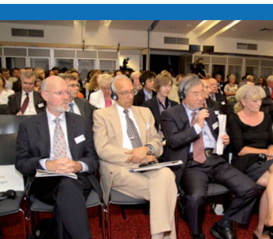
The audience during the key note speeches

sites. While World Heritage helps to preserve values, biosphere reserves are helping to create them. Placing environmental conservation in the context of development with and for people, I am convinced biosphere reserves must become leading instruments for promoting sustainable development”, Irina Bokova underlined.