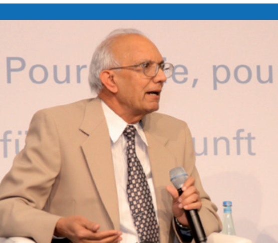
Prof Dr Rattan Lal

highest in the world: “It is quite well known today that we would need six planets if everybody in the world were to use natural resources as we do. We urgently need to change our attitude. We need to meet the basic requirements of life, and we still have to work hard for fulfilling the human rights to food and energy of the 1 billion people who are hungry today. Sustainable development is about meeting the basic requirements and human rights of 7 billion today and 9 billion in 2050.” In this regard, Martin Price underlined the importance of education to slow down population growth.