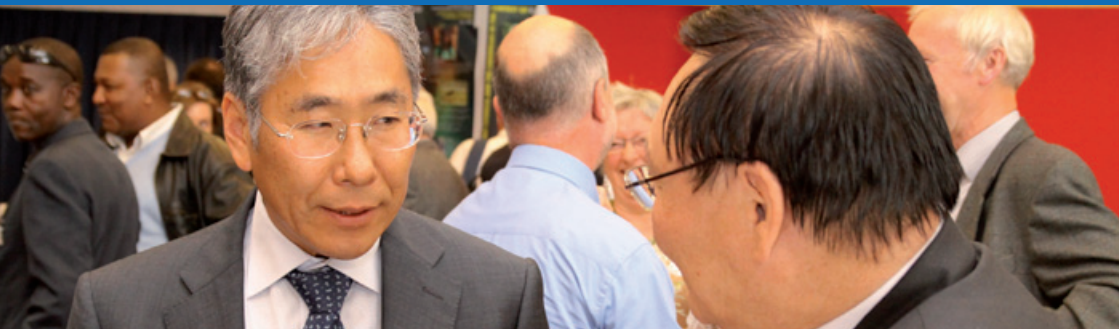
Delegates of 74 countries representing every continent came to Dresden