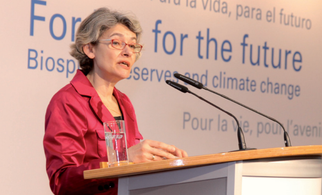
UNESCO Director-General Irina Bokova greeting the participants