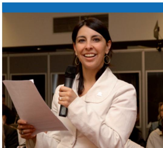
Delegates submit amendments to the Declaration