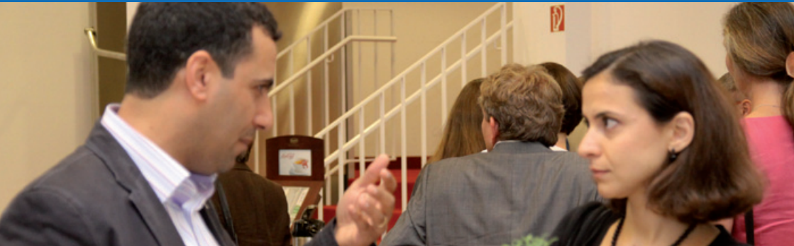
Conference participants discussing in the coffee break

fournissent des modèles pertinents pour un mode de vie durable. Les réserves de biosphère sont donc un élément important dans les stratégies visant à préserver une Terre viable pour l'avenir des générations futures.