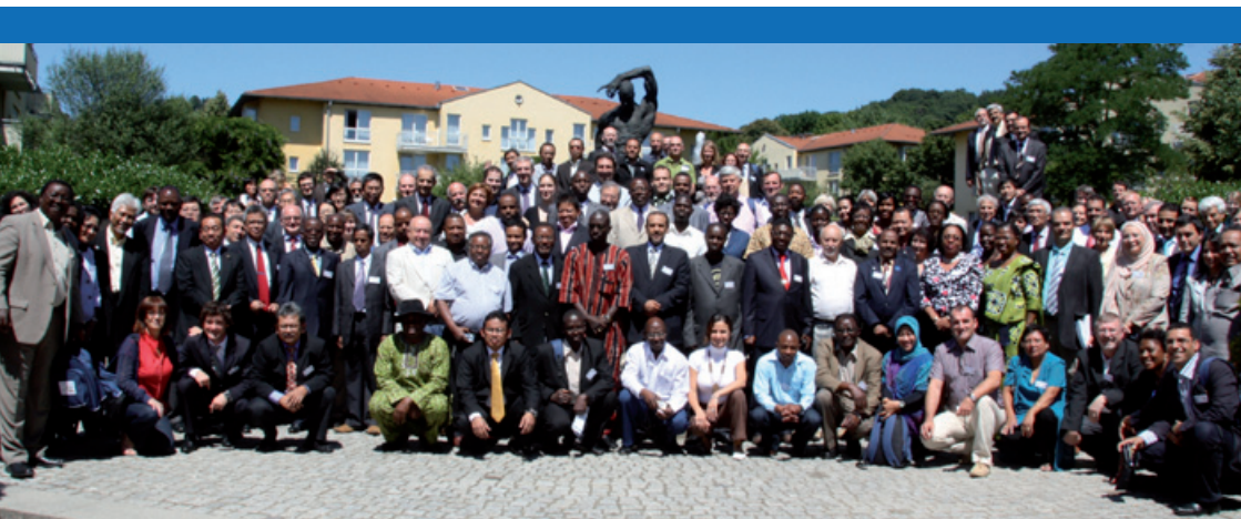
The participants in the courtyard of the conference centre

As flights are unavoidable for a conference with participants coming from all over world, the organizers have spent 4,600 Euro to offset emissions of 200,000 kg CO 2 - an amount extrapolated on the basis of the expected participants’ number - in Gold-standard certified carbon offset projects of the organisation „atmosfair“. The sum will be invested for example in a UNFCCC-supported project that generates electricity from crop residues in India.