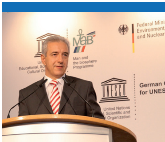
Prime Minister Stanislaw Tillich

The afternoon session was kicked off with a message of greeting by Stanislaw Tillich , Prime Minister of the Free State of Saxony. That UNESCO was celebrating the 40 th