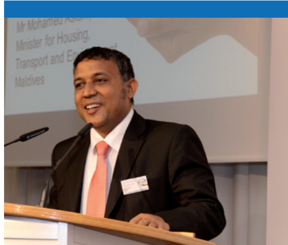
Minister Mohamed Aslam

Climate change is no longer a question of scientific research for the minister; it is a subject for action for the survi-