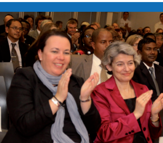
Ursula Heinen-Esser and Irina Bokova

to be included in financing systems dedicated to studies concerning the effects of climate change adaptation and mitigation measures” said Luis Fuego. The National Commission of Natural Protected Areas in Mexico has launched a “Climate change strategy for protected areas” as an instrument for direct climate change adaptation and mitigation actions in these areas. All this needs to be done because the costs caused by climate change are higher than those of mitigation. Therefore we need parallel measures: the implementation of policies by all levels of government and by society as a whole, the development of a legal framework and sufficient, appropriate and accessible funding.