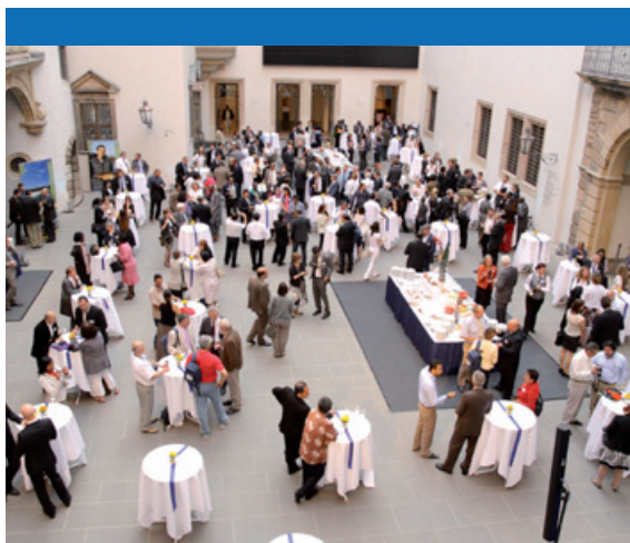
Evening reception at the Residenzschloss

initiative misses ‘interference’ with the concept that the biosphere reserves stand for” he added. At the same time the biosphere reserves cannot proceed in renewable energies without interference with this other, more regulatory world. As a good example he referred to a community-based biodiesel programme in Northern Brazil, financed by a levy on ordinary diesel. “It’s not only about local capacities, the local regulations and options. It is at the same time important to change the rules in the market; this is why UNEP’s financial initiative is so important. The best local activities will fail if the market signals are wrong. It is not an either-or. We have to work on both ends in order to achieve truly sustainable bioenergies.”