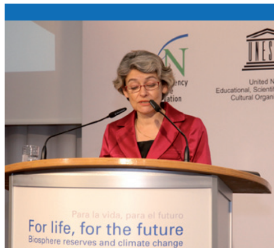
UNESCO Director-General Irina Bokova

national and international level. Germany would like to lead by example. The country has already earmarked funds from the “International Climate Initiative” (IKI) of the Ministry for the Environment for projects to protect global biodiversity and to use it sustainably.