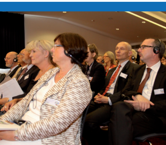
The audience listening to keynote speeches.

didn't wait until the turbo engine was perfect to bring trains on track. You brought trains on track with steam engines. In the same manner, we want to start right now. And when the Maldives can do it, people will say: If it can be done in a small community like the Maldives, it can be done elsewhere."