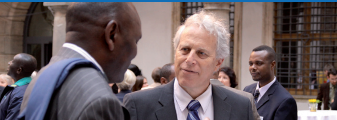
Conference participants during the evening reception in the royal castle “Residenzschloss” in Dresden