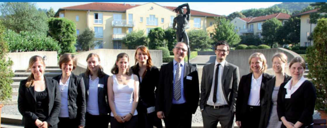
The conference organizing team of the German Commission for UNESCO

Honda Deutschland GmbH (providing a free shuttle service with hybrid cars)